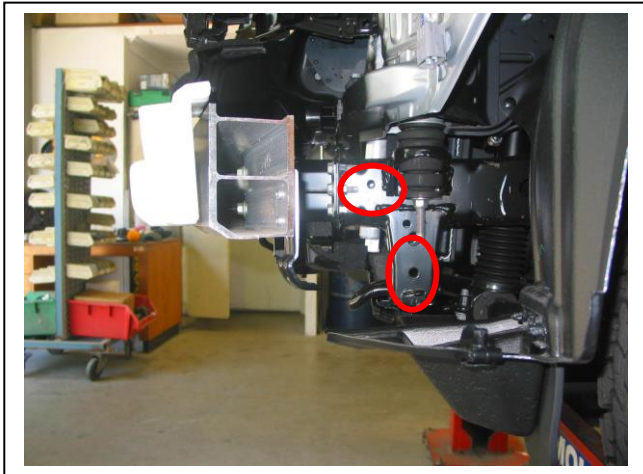
Figure 1: Passengers side of vehicle showing holes used in fitment