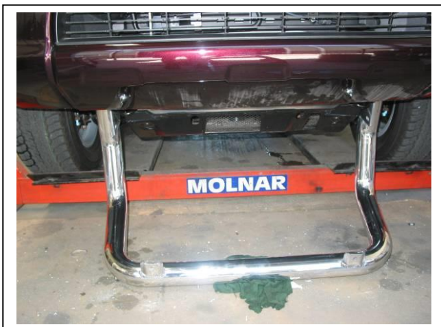
Figure 3: Protection bar positioned ready for fitment.