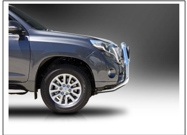
Figure 6: Side view, Series 2 Nudge Bar.