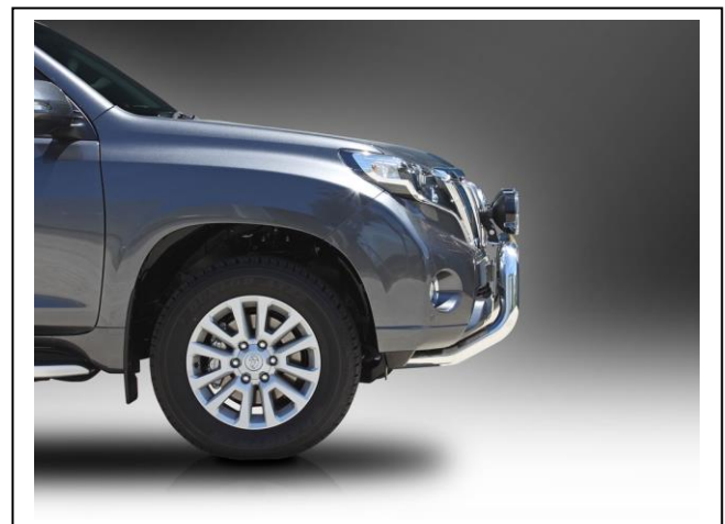
Figure 4: Side view 76mm Nudge Bar.