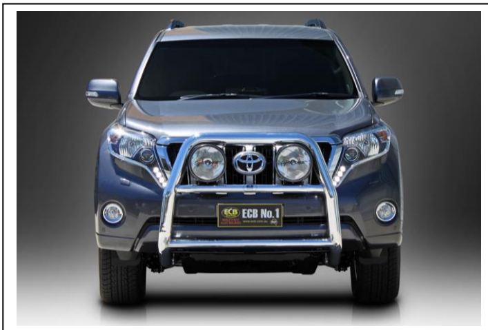
Figure 7: Front View, Series 2 Nudge Bar