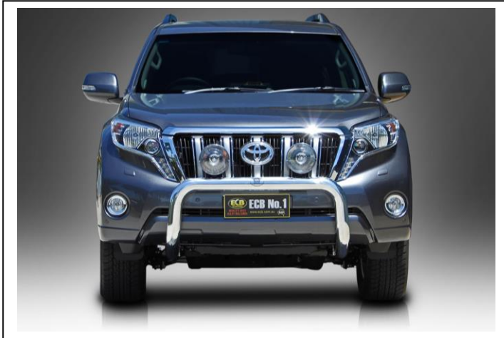
Figure 5: Front view, 76mm Nudge Bar