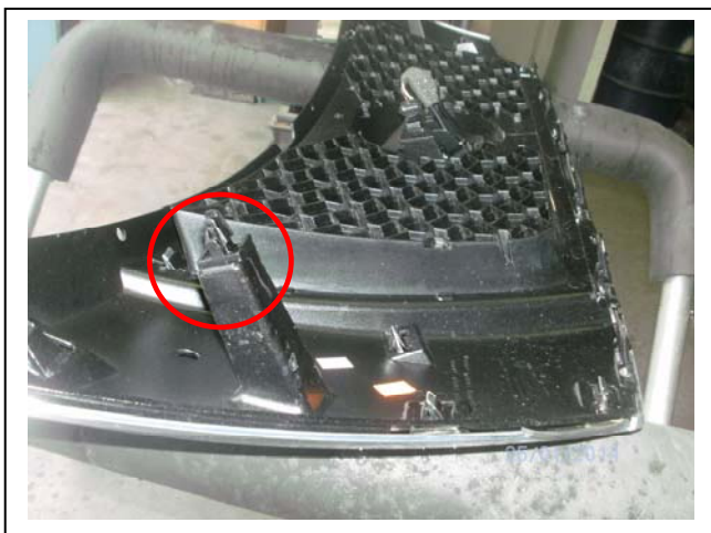
Figure 1: Grille showing placement of top head light mount.