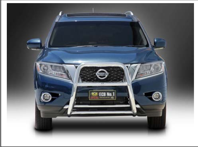
Figure 9: Series 2 nudge bar front view