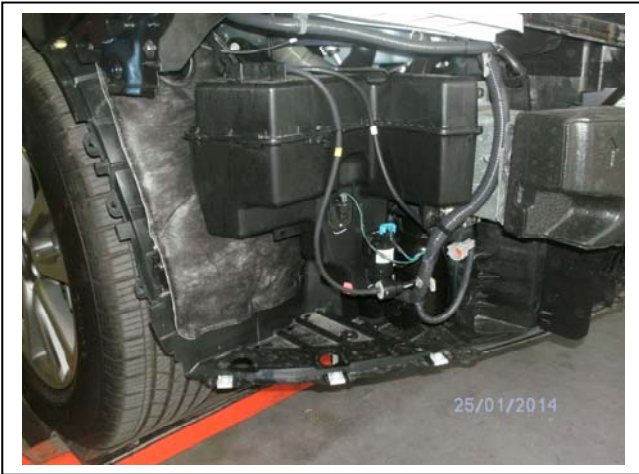
Figure 3: Recommended fog light disconnection point, drivers side.