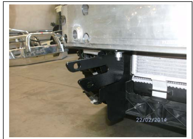
Figure 6: bumper support and mount fitted to vehicle.