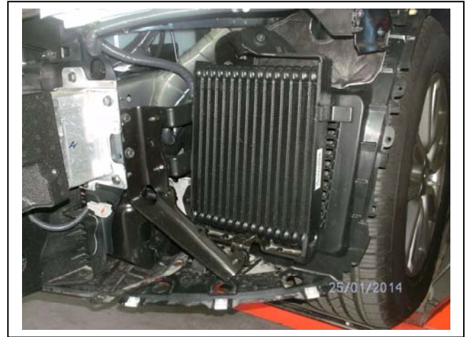
Figure 4: Recommended fog light disconnection point, passengers side.