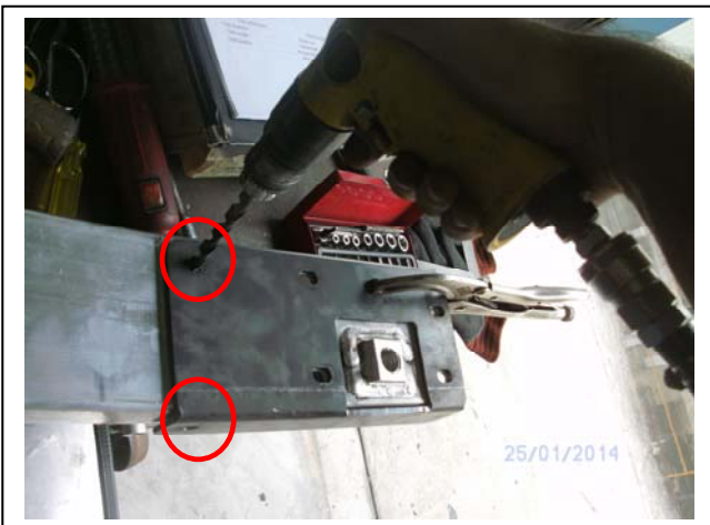
Figure 5: Clamp and drill inner holes in mount. Holes to drill circled.