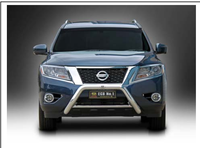
Figure 7: 76mm Nudge bar front view