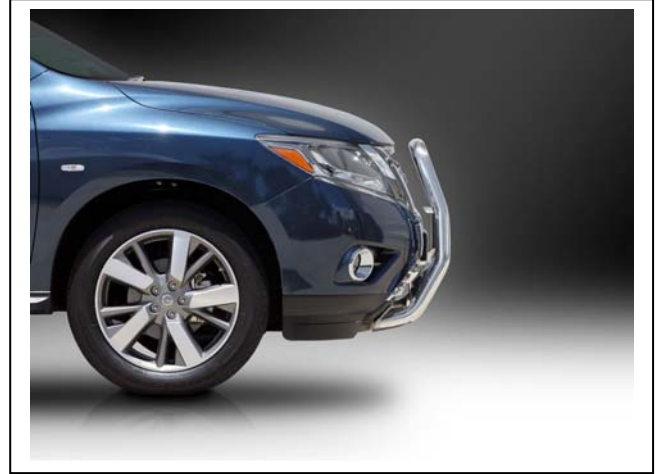
Figure 10: Series 2 nudge bar side view