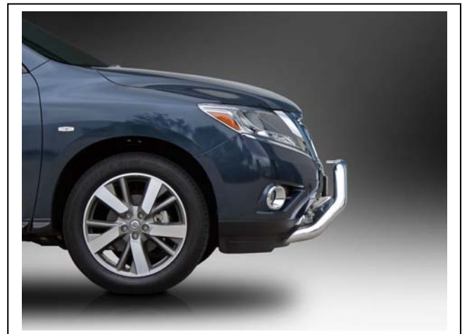
Figure 8: 76mm Nudge bar side view