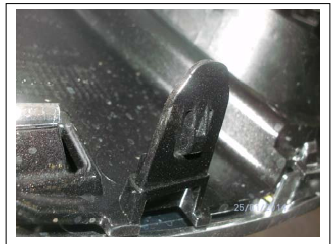
Figure 2: Close up of lower grille mount.