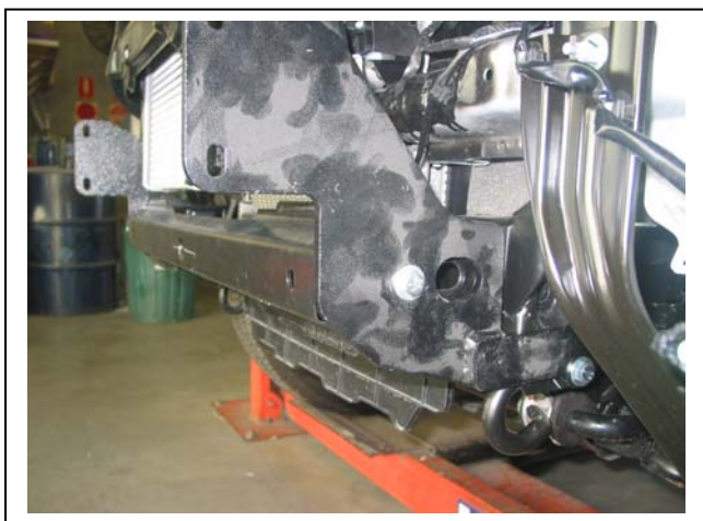
Figure 3: Steel mount fitted to vehicle with bumper removed for photo.