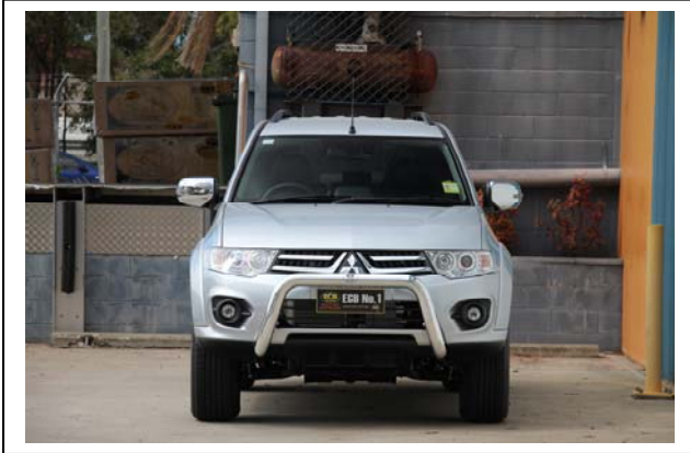
Figure 5: Front view