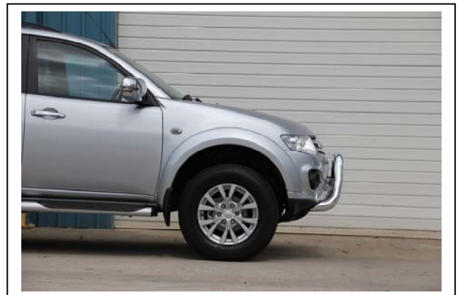
Figure 4: Side view