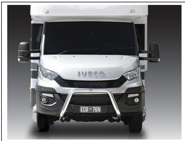
Figure 5 – Front view shown