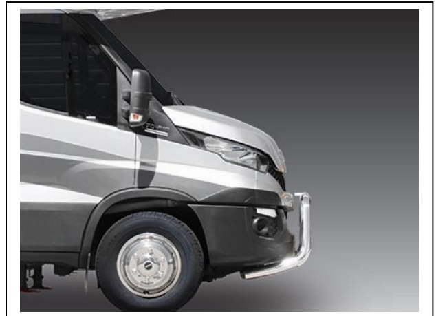
Figure 4 – Side view shown