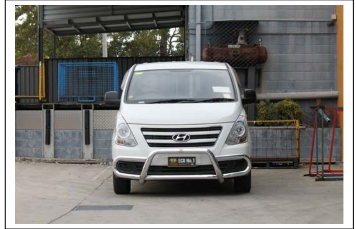
Figure 10: Midi Bar front view