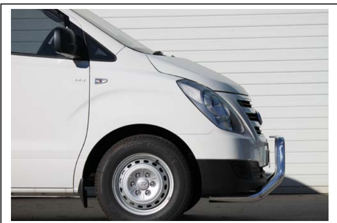
Figure 7: Nudge Bar side view