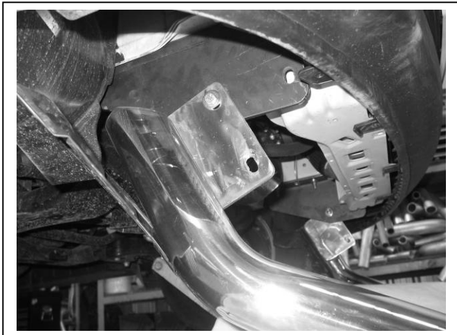
Figure 5: Rear bolts installed before Nudge Bar swung up onto vehicle.