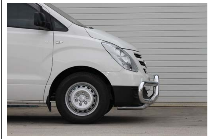
Figure 9: Midi Bar side view