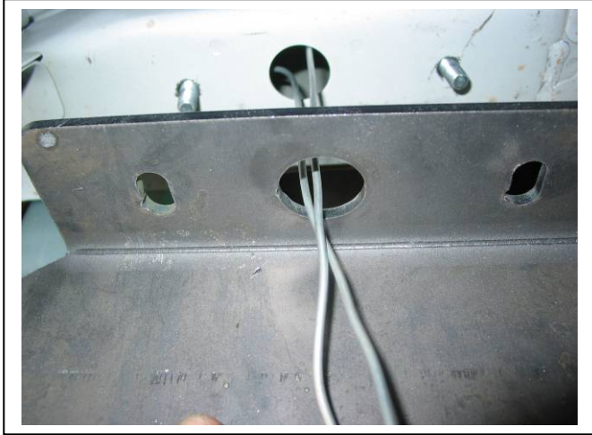
Figure 3: Fitting ECB Steel mounts to 3/8 x 2 bolts and washers on wire in chassis