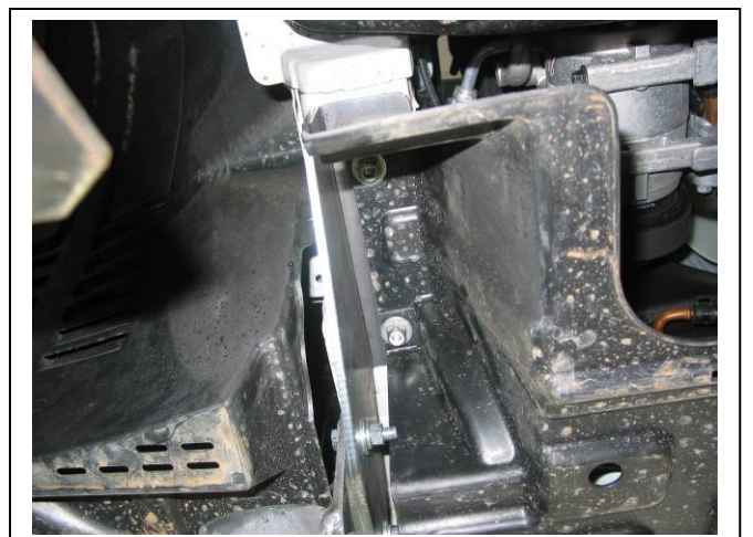
Figure 8: Drilled plastic cover fitted back to vehicle using 3/8 nyloc nuts and flat washers