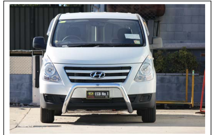
Figure 6: Nudge Bar front view