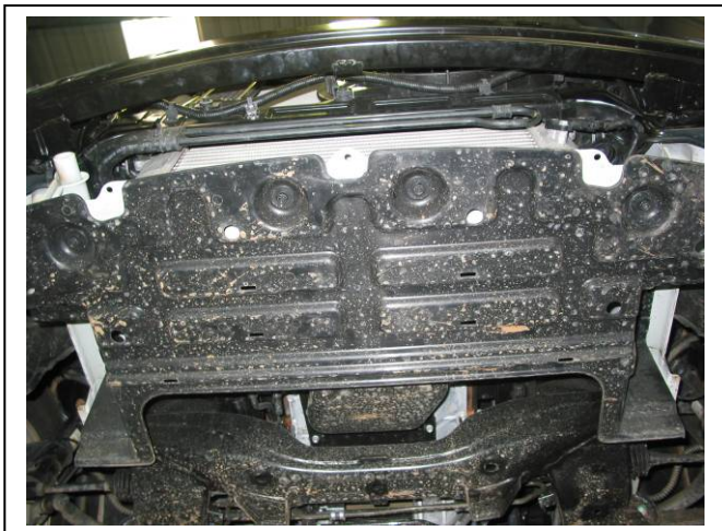
Figure 1: Front under body guard showing front four 10mm head bolts.