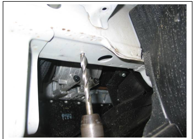
Figure 2: Enlarge holes to allow 3/8 bolts on wire for steel mount fitment.