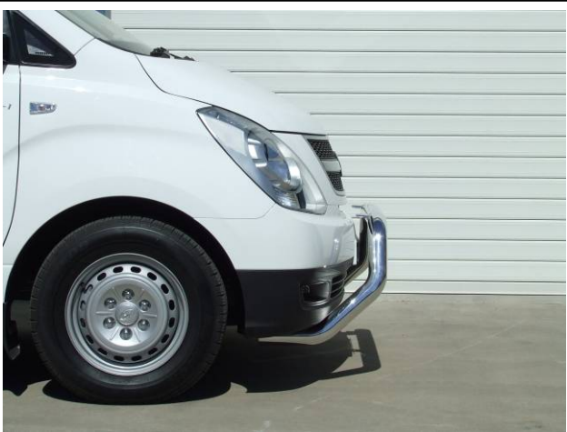
Figure 7: Nudge Bar side view