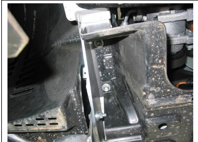
Figure 8: Drilled plastic cover fitted back to vehicle using 3/8 nyloc nuts and flat washers