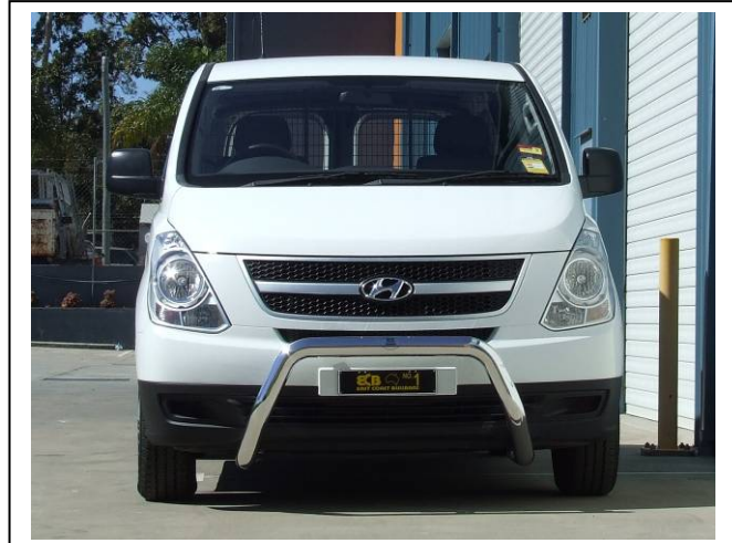
Figure 6: Nudge Bar front view