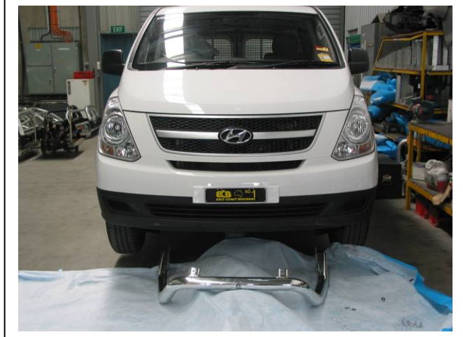
Figure 4: Nudge Bar laid out ready for fitment.