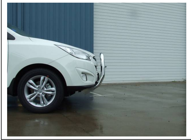
Figure 8: Side view, Series 2 Nudge Bar