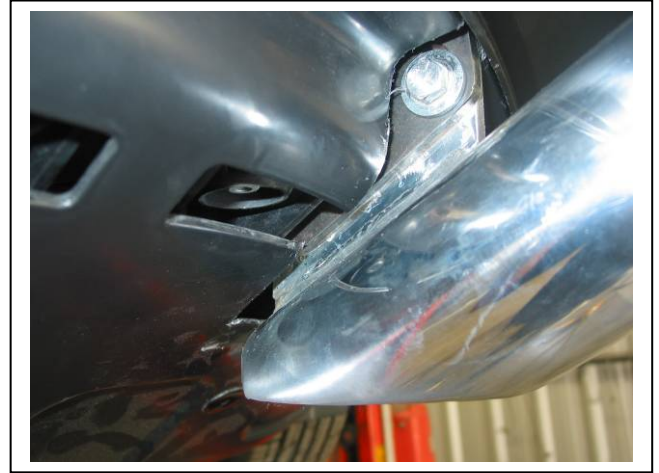
Figure 9: Under body guard fitted above 76mm Nudge bar