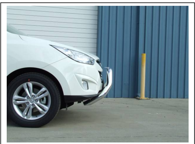
Figure 6: Side view, 76mm Nudge Bar