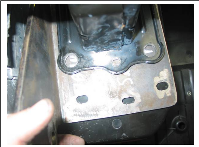
Figure 2: Inserting drivers side mount behind bumper support.