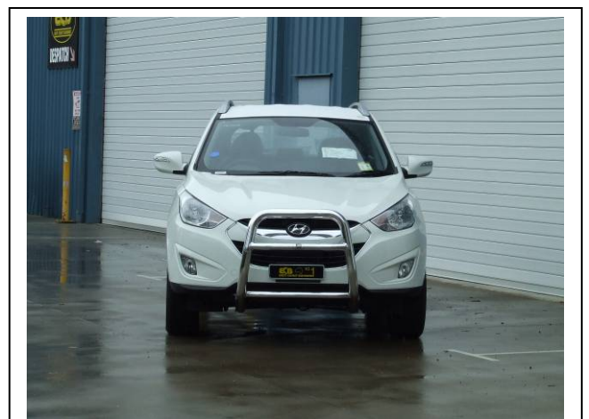
Figure 7: Front view, Series 2 Nudge Bar