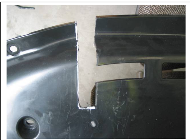
Figure 4: Trimmed under body guard, removed from vehicle for photo.