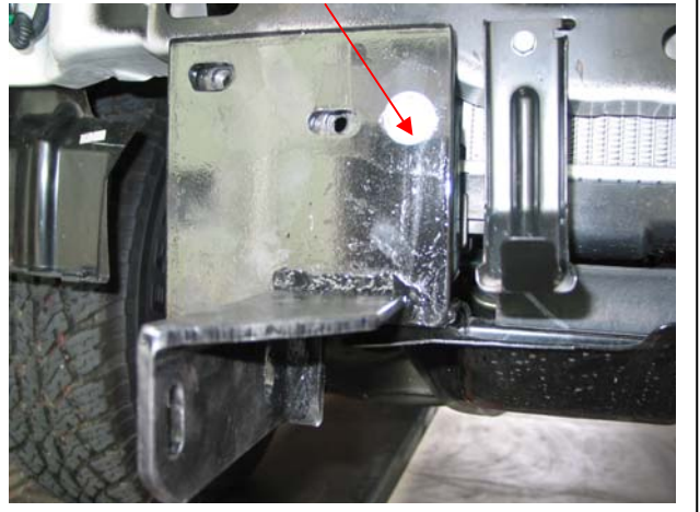
Steel mounting bracket