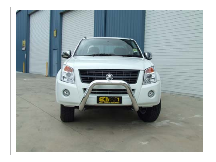
Figure 7 – RA7 76mm Nudge Bar front view shown