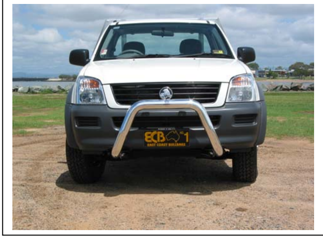
Figure 5 – RA 76mm Nudge Bar front view shown