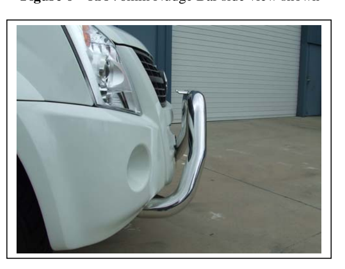
Figure 8 – RA7 76mm Nudge Bar side view shown