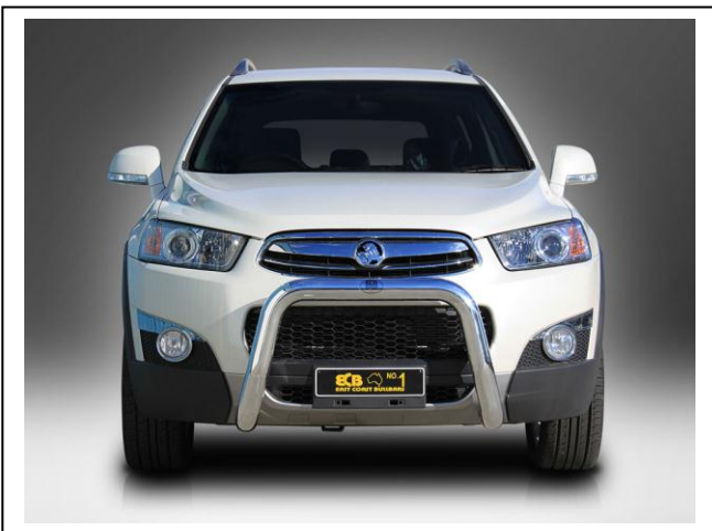
Figure 5: Front view, 76mm Nudge Bar