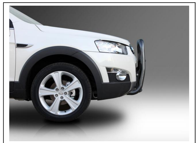
Figure 8: Side view, Series 2 Nudge Bar