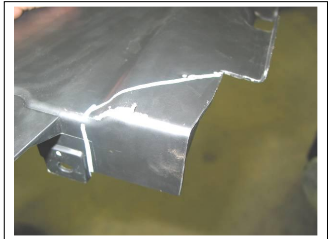
Figure 4: Bottom corner of drivers side air dam. Trim along white line.