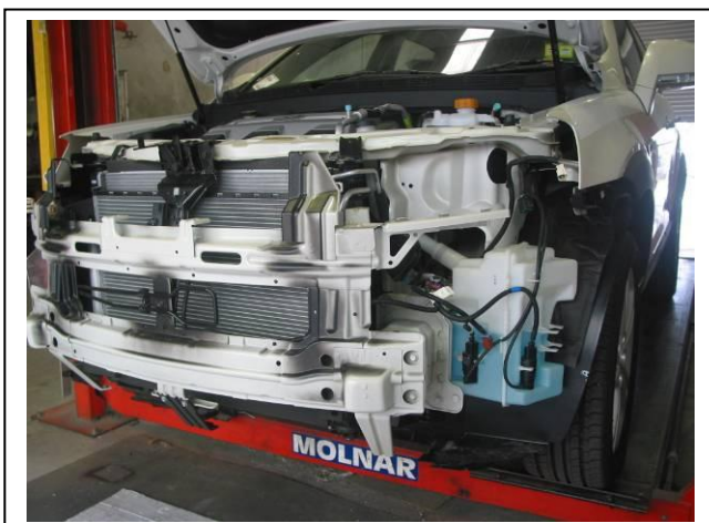
Figure 1: Vehicle with bumper removed