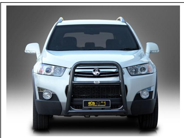
Figure 7: Front view, Series 2 Nudge Bar