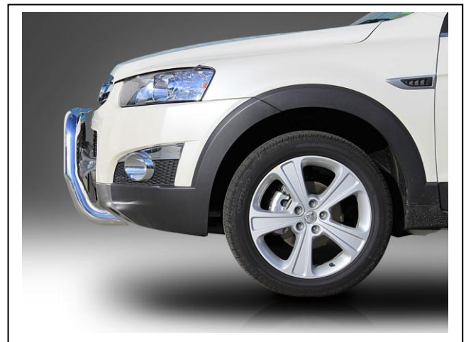
Figure 6: Side view, 76mm Nudge Bar