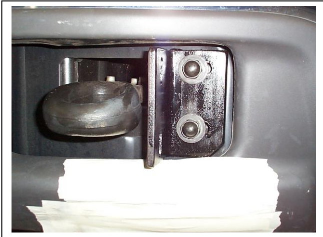
Figure 1 – Passenger side shown