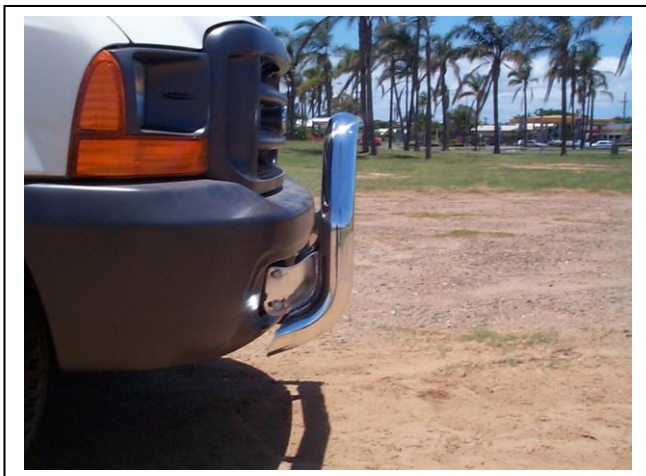
Figure 3 – 76mm Nudge Bar