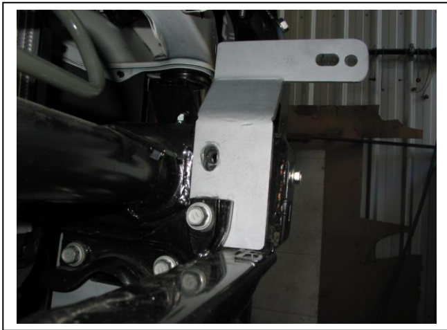
Figure 1 – Passenger side shown (bumper removed for photo)