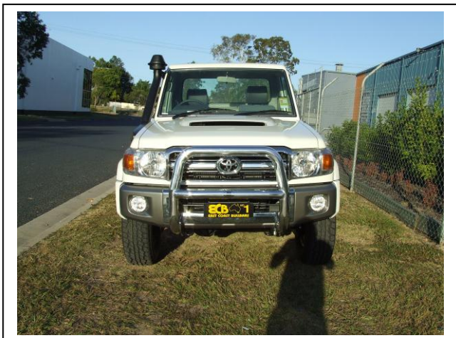
Figure 3 – Front view shown