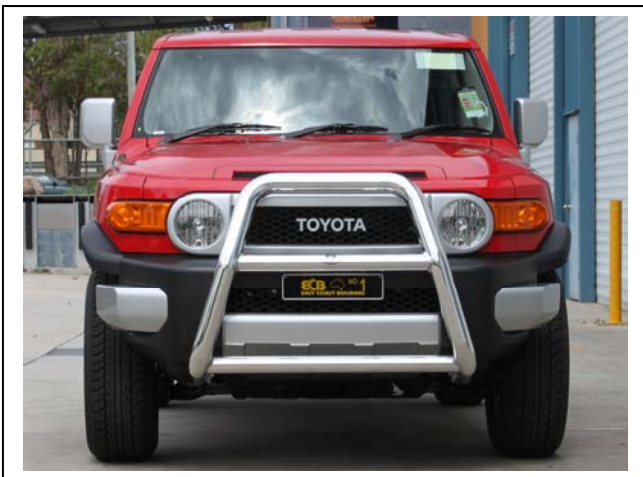
Figure 3: Front view, 76mm Nudge Bar