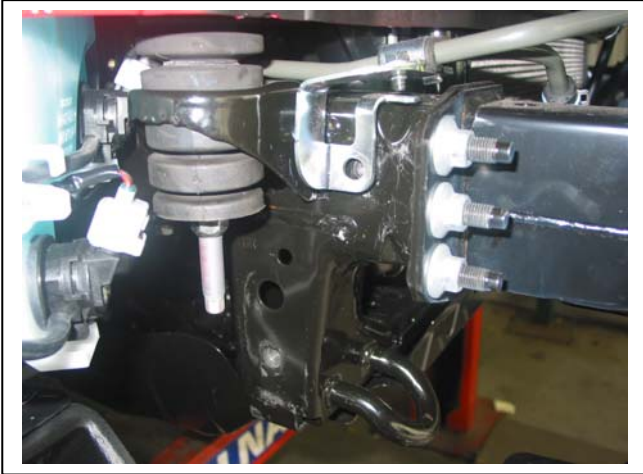
Figure 1: Drivers side of vehicle showing power steering bracket with bolt removed.