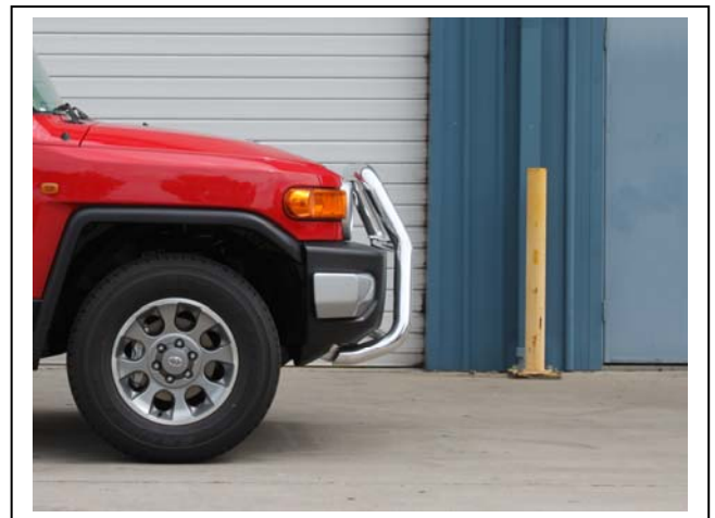
Figure 4: Side view, Series 2 Nudge Bar.