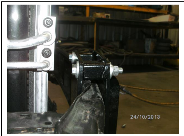
Figure 7: Placement of bolts on mounts