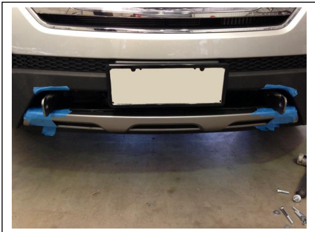
Figure 11: Plastic bumper fitted over mounts