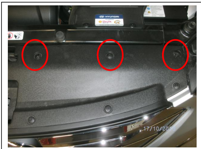
Figure 1: Top of radiator support between headlights. Passenger side shown.