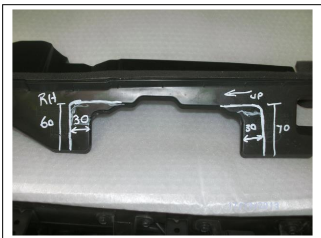
Figure 5: Right hand (drivers side) air dam measurements. Removed from vehicle for photo.