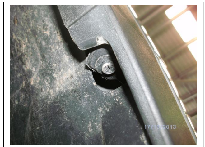
Figure 2: Bolt in rear of plastic bumper