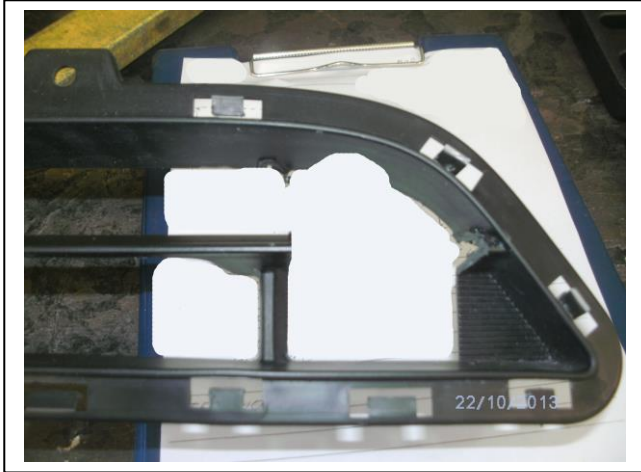
Figure 9: Trim of grille