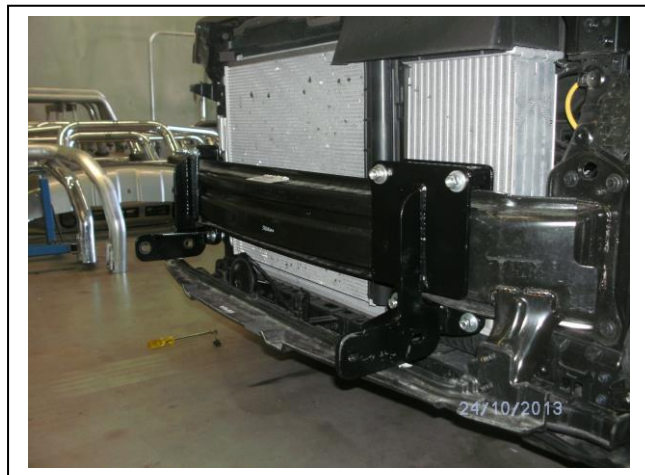
Figure 8: placement of mounts on bumper support.