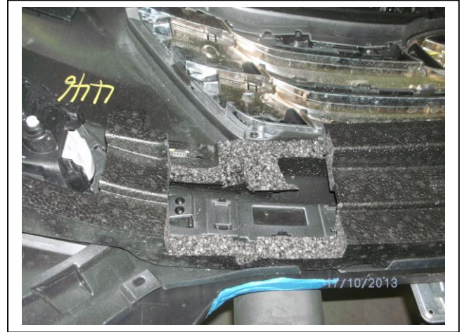
Figure 10: Trim of polystyrene bumper infill