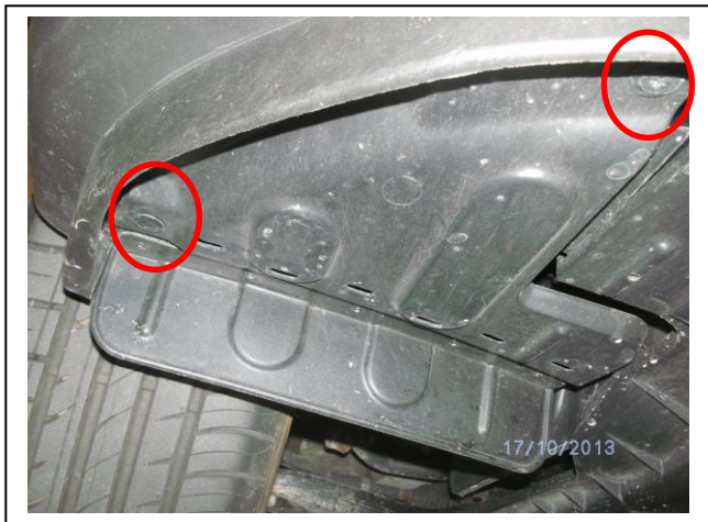
Figure 3: Lower inner guard attachment points