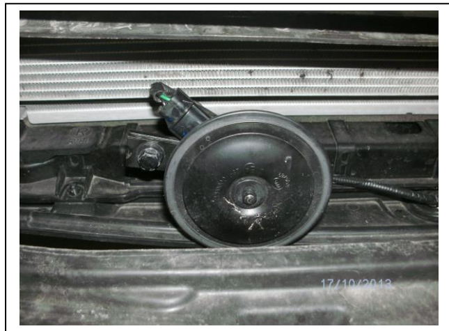
Figure 4: Horn after being moved