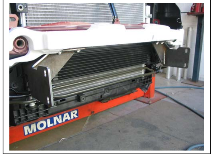
Figure 4: Support panel and mounts refitted to vehicle