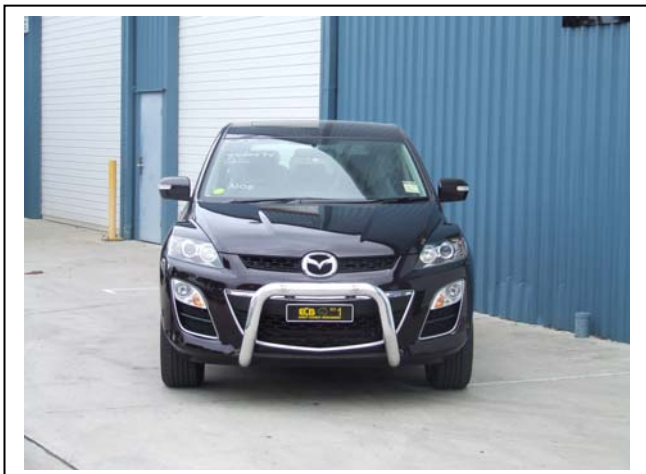
Figure 7: Front view 76mm Nudge Bar