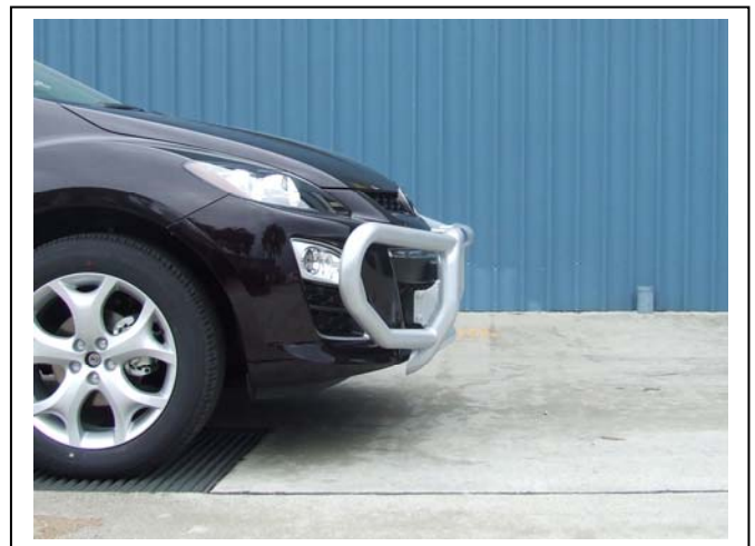
Figure 12: Side view Midi Tube Bar