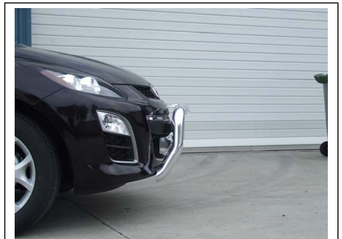
Figure 8: Side view 76mm Nudge bar