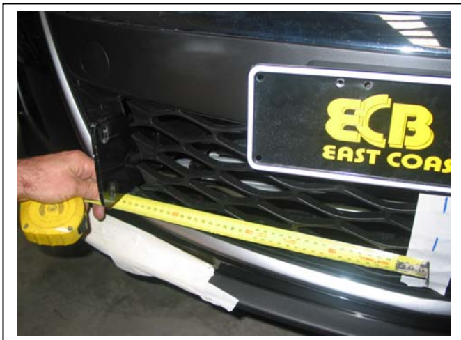
Figure 5: Measuring from centre for mount openings in lower grille