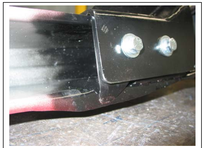
Figure 2: Steel mount bracket mounted to bumper support panel