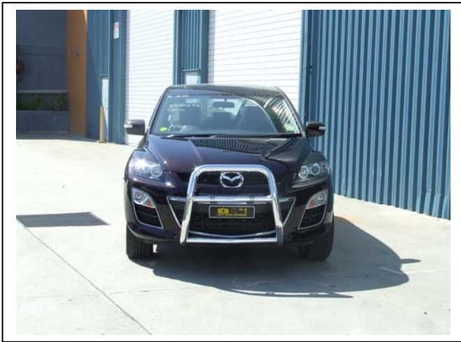
Figure 9: Front view Series 2 Nudge Bar