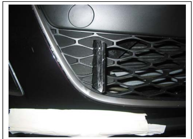
Figure 6: Webs cut from grille