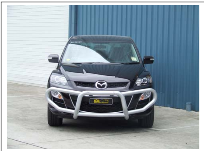
Figure 11: Front view Midi Tube Bar