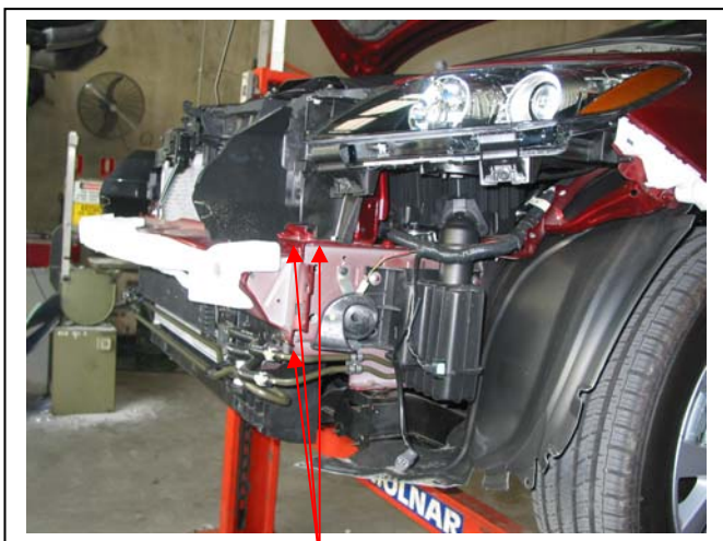
Figure 1: Bumper support panel bolts, three 14mm head bolts (per side)