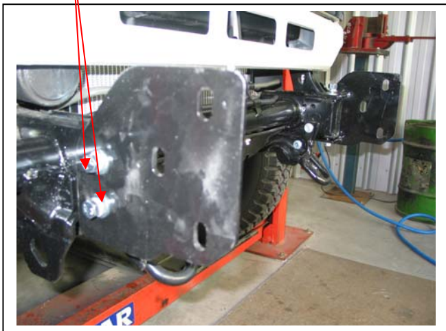
Figure 1 – Drivers side shown