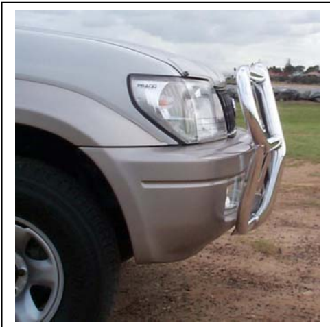
Figure 1 – Type 8 Alignment