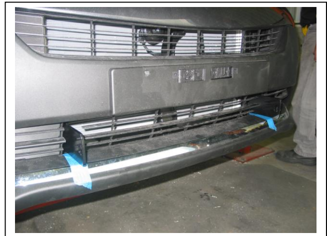
Figure 4: Refit plastic bumper