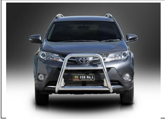
Figure 7: Series 2 Nudge Bar front view