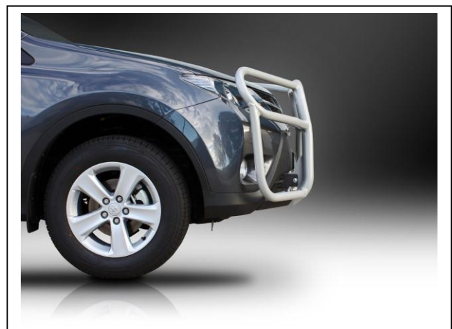
Figure 6: Type 8 side view