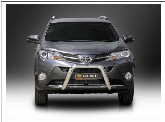
Figure 9: 76mm Nudge Bar front view