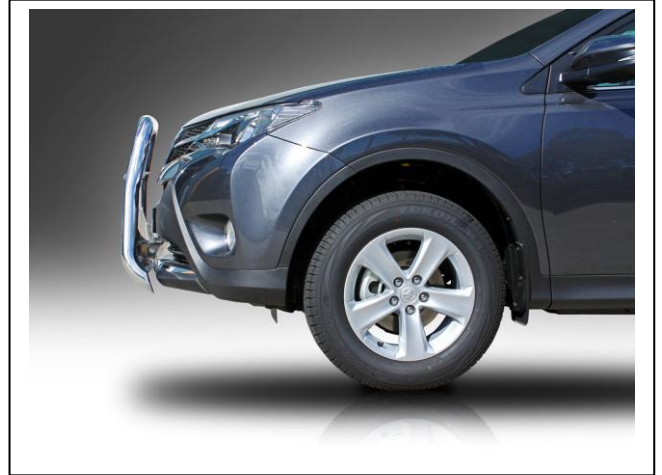
Figure 8: Series 2 Nudge Bar side view