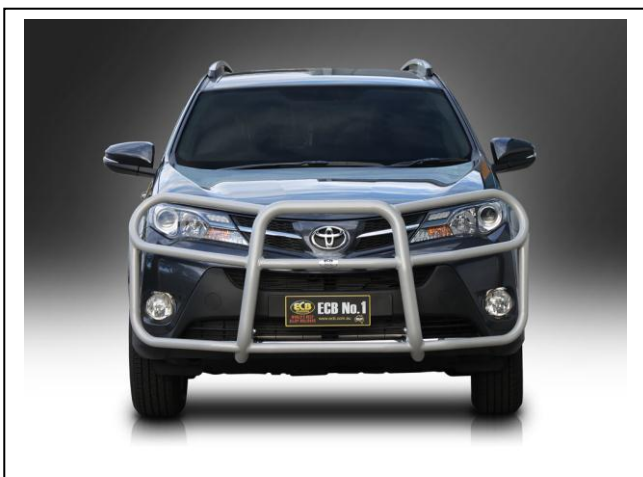
Figure 5: Type 8 front view