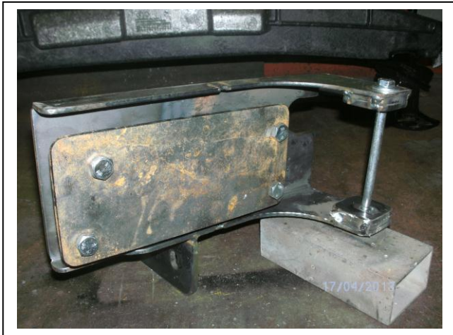
Figure 1: Rear of mount showing bolt direction. Bumper support removed for photo.