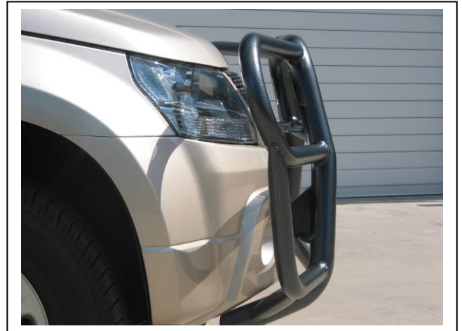
Figure 14 – Type 8 side view shown