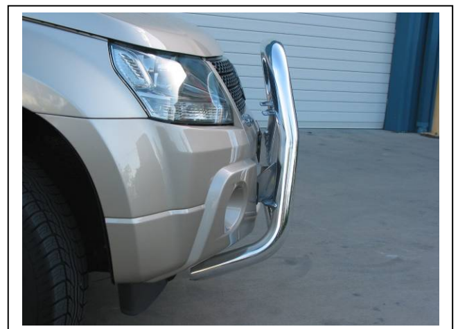
Figure 16 – 63mm Series 2 Nudge Bar side view shown