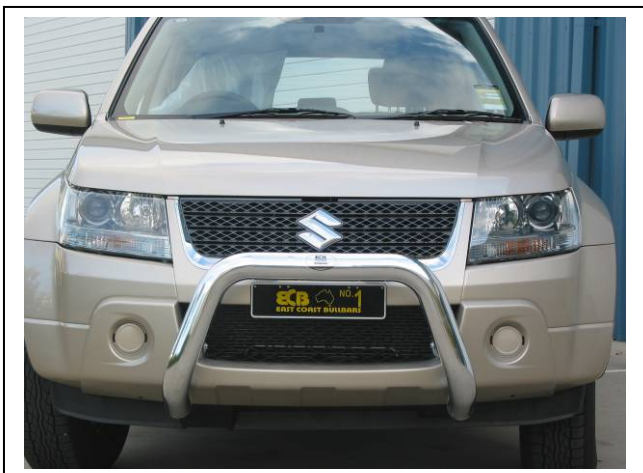
Figure 17 – 76mm Nudge Bar front view shown