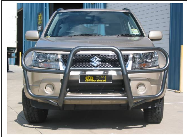
Figure 13 – Type 8 front view shown