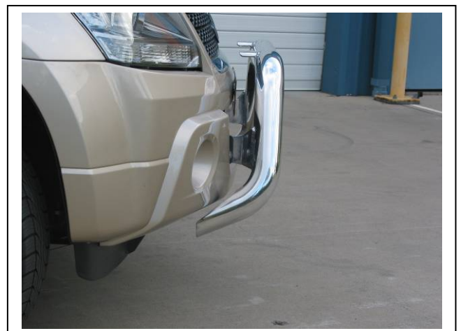
Figure 18 – 76mm Nudge Bar side view shown