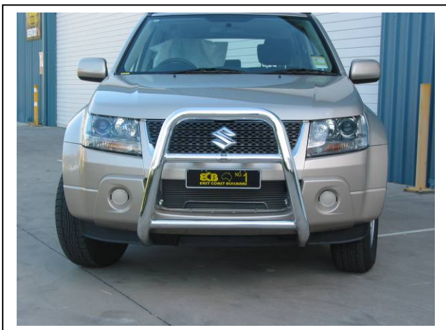
Figure 15 – 63mm Series 2 Nudge Bar front view shown