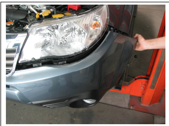
Figure 1: Unclip bumper from guard and light