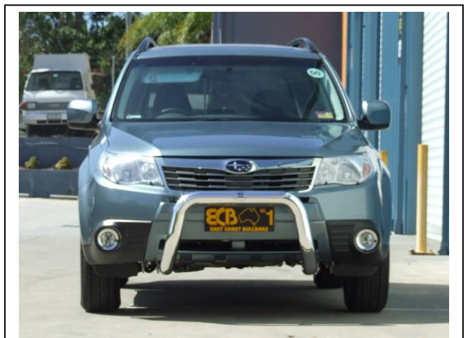
Figure 8: Nudge Bar front view