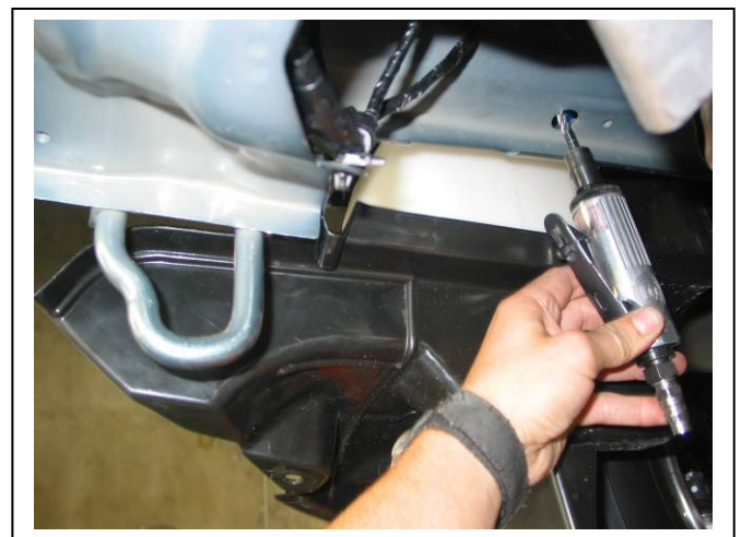
Figure 2: Die grind hole to allow fitment of bolt and washer on wire