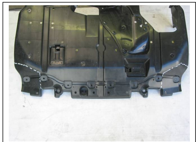
Figure 14: Approximate trim on centre splash guard