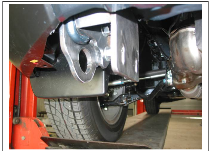
Figure 6: Steel mounting bracket fitted to brace.