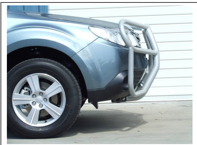
Figure 13: Type 8 Loop Bar side view