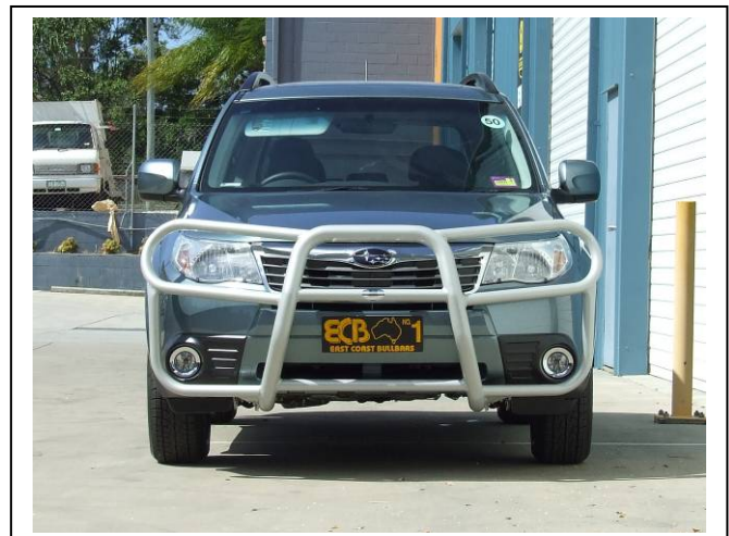
Figure 12: Type 8 Loop Bar front view