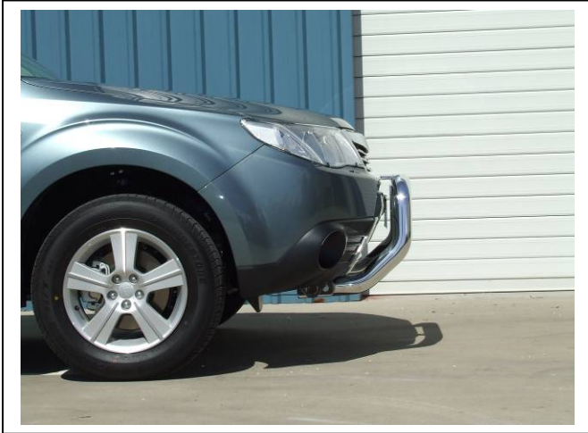
Figure 9: 76mm Nudge Bar side view