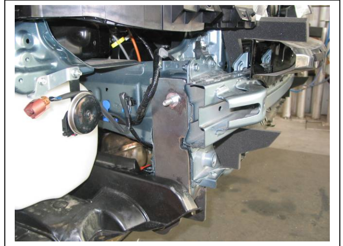
Figure 4: Top mount and bolt