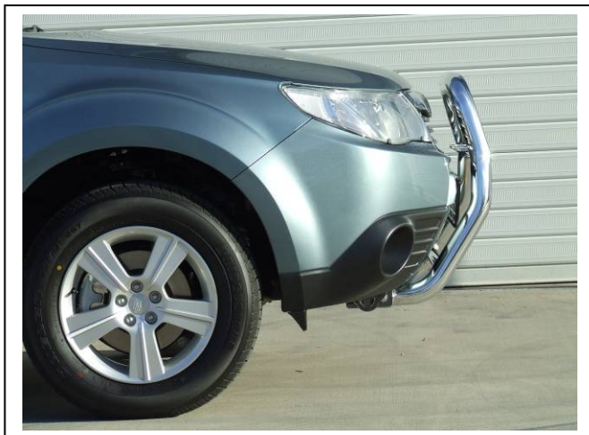
Figure 11: 63mm Series 2 Nudge Bar side view