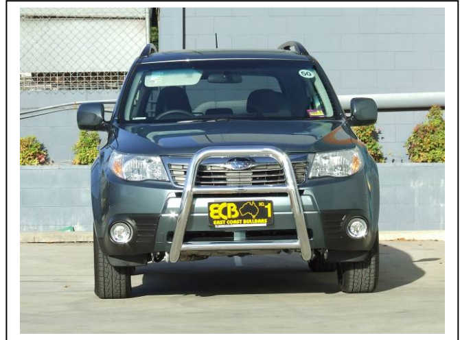
Figure 10: 63mm Series 2 Nudge Bar front view