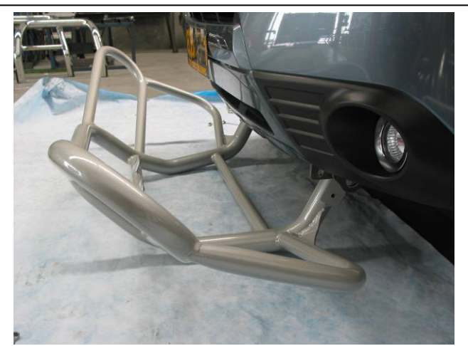
Figure 7: Protection bar laying on soft mat for fitment