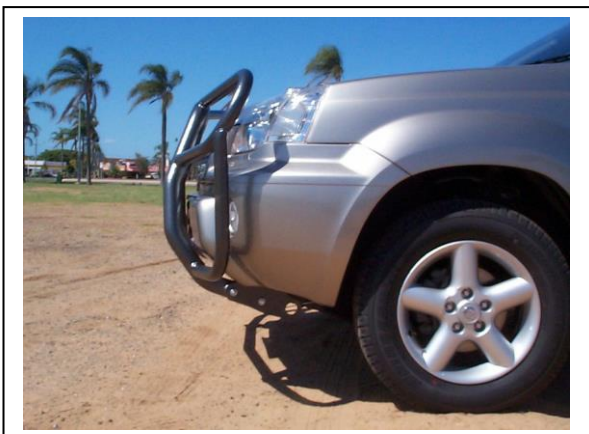
Figure 3 – Type 8 side view