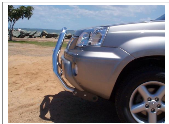
Figure 4 – 63mm Series 2 Nudge Bar side view