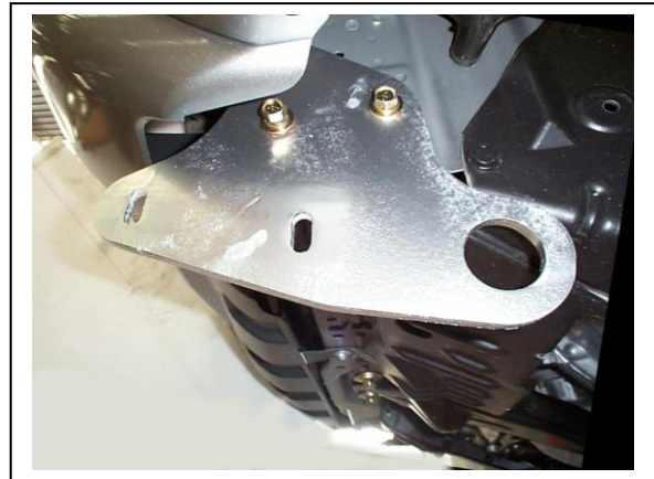
Figure 2 – Passenger side shown