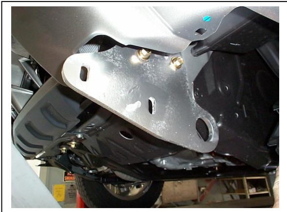
Figure 1 – Passenger side shown