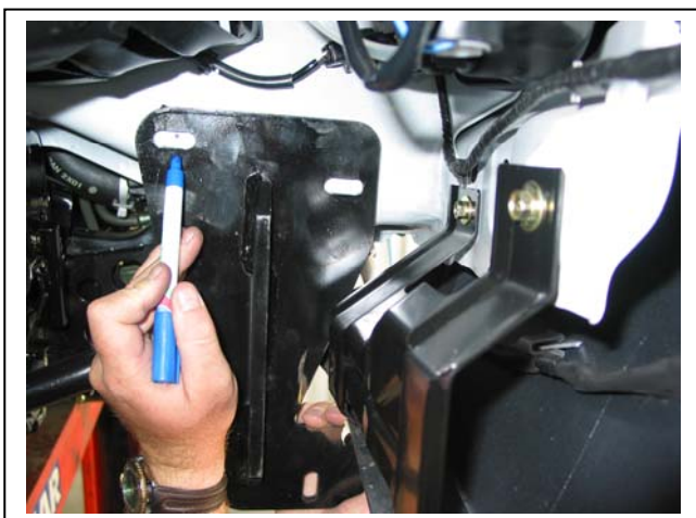
Figure 1 – Marking centre of rear slot for centre punch and drilling