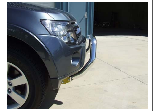
Figure 10 – 76mm Nudge Bar side view shown