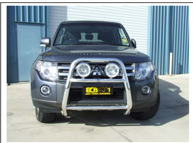
Figure 7 – 63mm Series 2 Nudge Bar front view shown