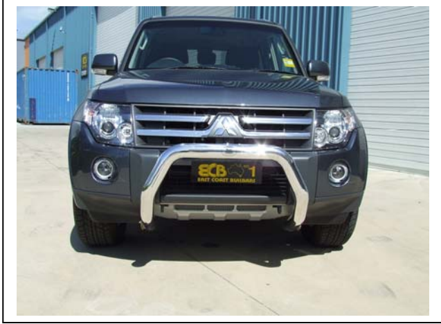
Figure 9 – 76mm Nudge Bar front view shown