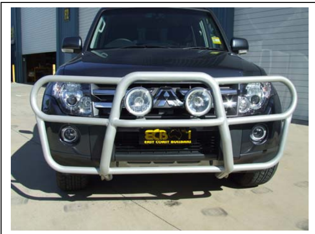
Figure 5 – Type 8 front view shown