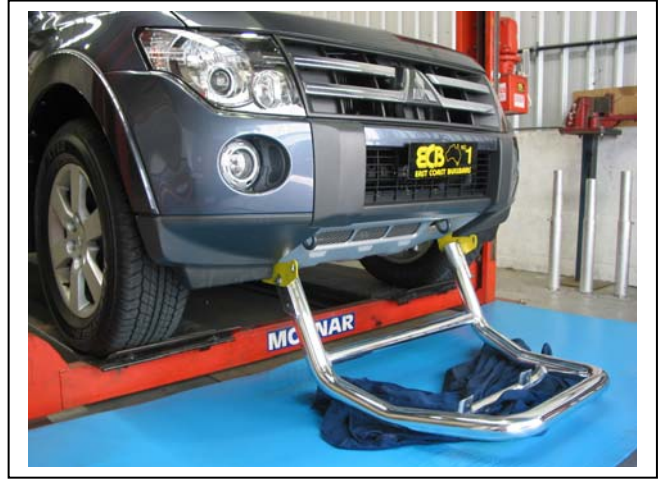
Figure 4 – Series 2 Nudge Bar shown