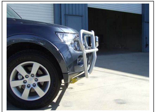
Figure 6 – Type 8 side view shown