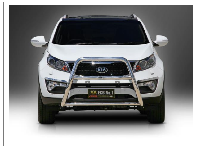
Figure 6: Series 2 front view