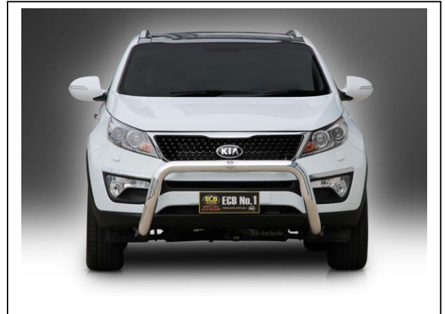
Figure 8: 76mm Nudge Bar front view