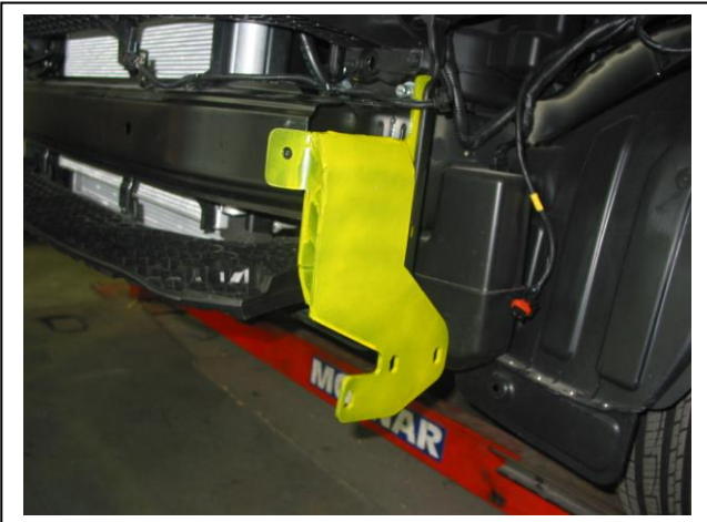
Figure 1: Passengers side mount behind bumper support.