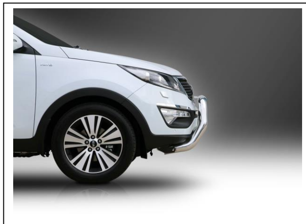
Figure 9: 76mm Nudge Bar Side view