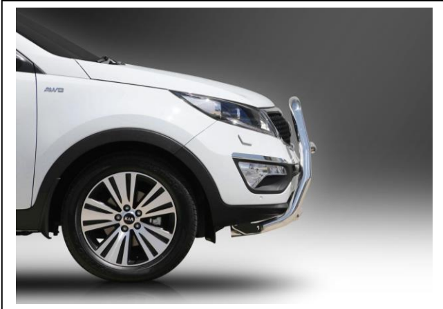
Figure 7: Series 2 side view