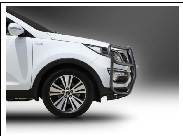
Figure 5: Type 8 side view