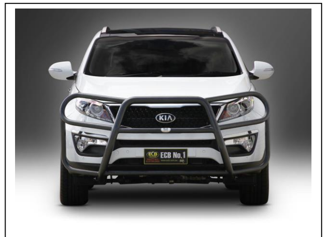
Figure 4: Type 8 front view