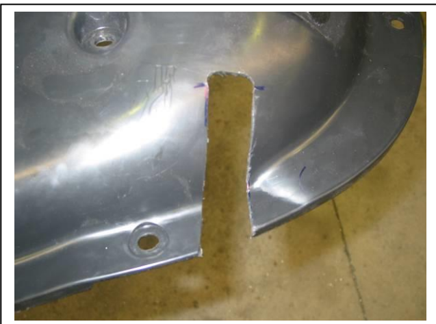
Figure 3: Trimmed under body guard. Note: Trim guard to suit your vehicle. Trimmed area will vary.