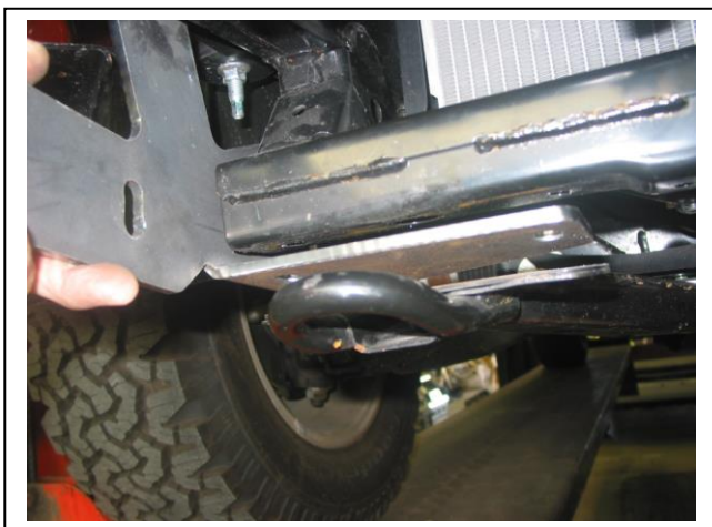
Figure 3: Fitting mount under stabilizer bar