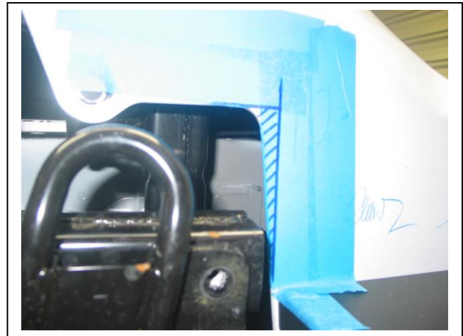
Figure 2: Trim 15mm from front edge of bumper shown.