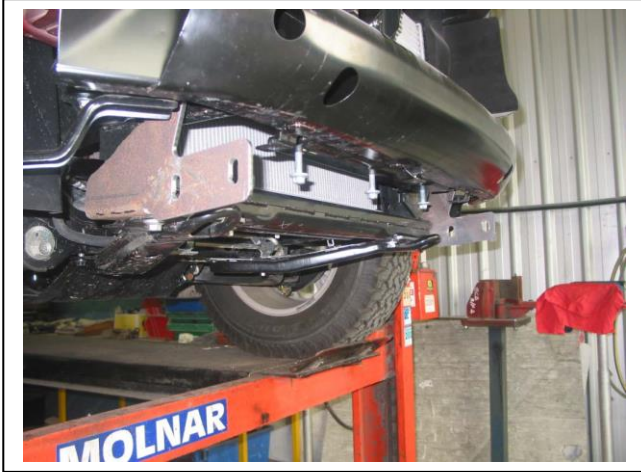
Figure 5: Steel mounts fitted to vehicle. Bumper removed for photo