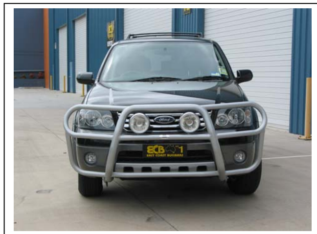
Figure 4 – Type 8 front view