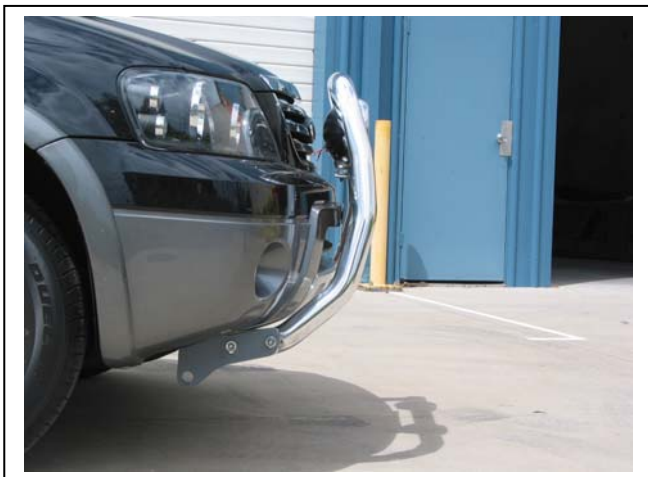
Figure 7 – 76mm Nudge Bar side view shown