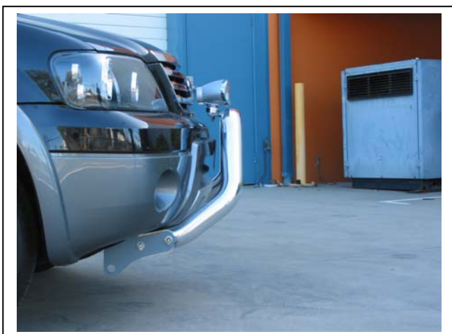
Figure 9 – 76mm Nudge Bar side view shown