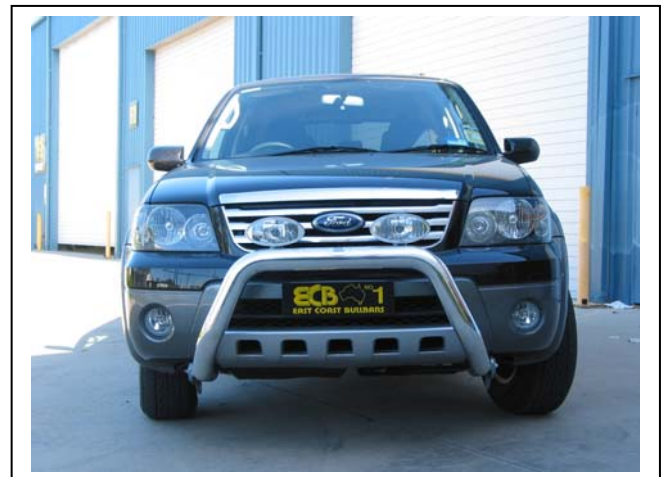
Figure 8 – 76mm Nudge Bar front view shown