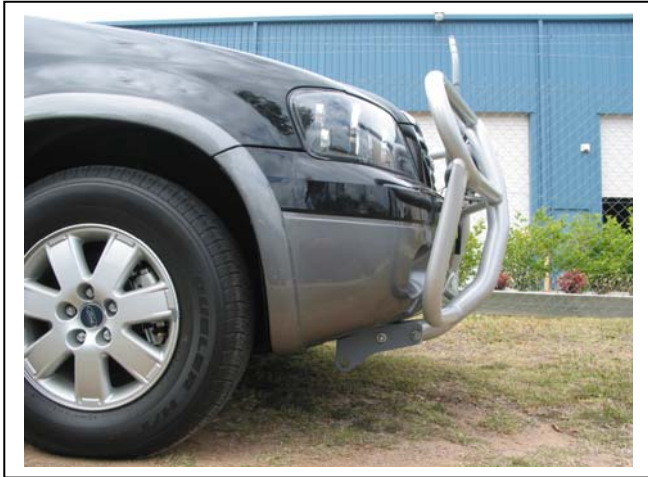
Figure 5 – Type 8 side view shown