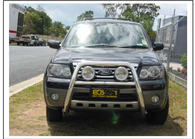
Figure 6 – 63mm Series 2 Nudge Bar front view shown