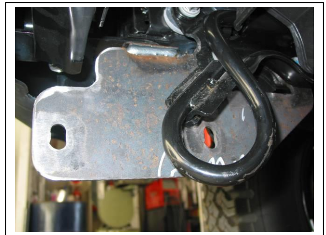
Figure 2: Drivers side mount fitted