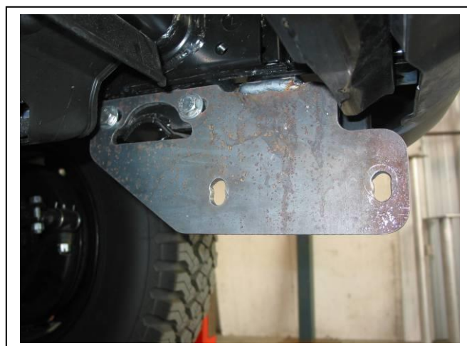
Figure 3: Passengers side mount fitted