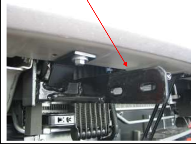
Figure 3 – Drivers side shown