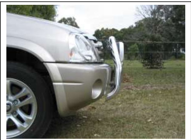
Figure 7 – 63mm Series 2 Nudge Bar shown