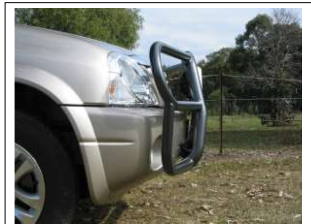
Figure 8 – Type 8 shown