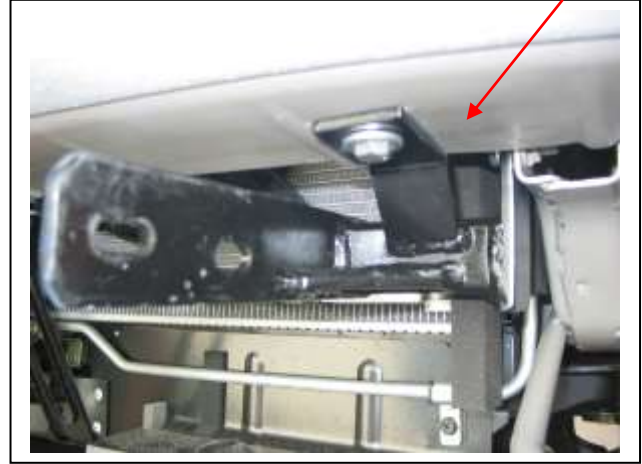
Figure 4 – Passenger side shown