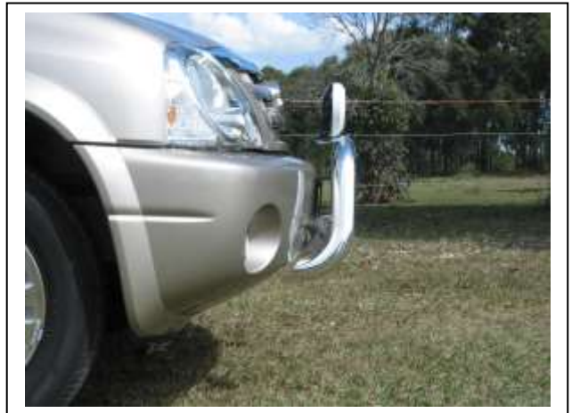
Figure 6 – 63mm Nudge Bar shown