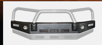
One Piece Channel