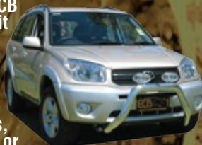
76mm NUDGE BAR 07/00 - 12/05 Mirror Polished Alloy

Contact the ECB National Customer Service Centre for your local ECB Outlet