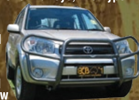
TYPE 8 BAR 07/00 - 12/05 Silver Hammertone Powdercoat Alloy

inclusions. For a superior low maintenance finish choose an ECB powdercoat style.