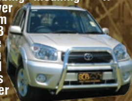
63mm SERIES 2 NUDGE BAR 07/00 - 12/05 Mirror Polished Alloy