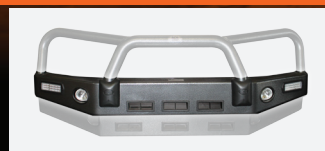
One Piece Channel