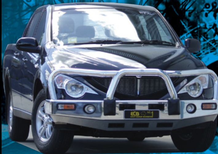
Ssangyong Actyon ECB Arc Bar Mirror Polished Alloy