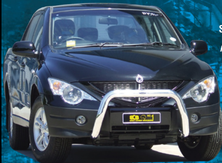
Ssangyong Actyon 76mm Nudge Bar Mirror Polished Alloy