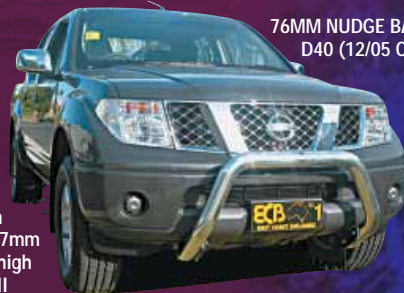
76MM NUDGE BAR D40 (12/05 On)

ensures a neat and sturdy fitment. Indicator/Park Light Combinations, Air Directional Cooling Vents, Driving Light mounting points and an Aerial Bracket are all standard features. To complete a great looking performance product, why not choose from ECB's range of superior, low maintenance powder coated finishes? A durable alternative to polishing.