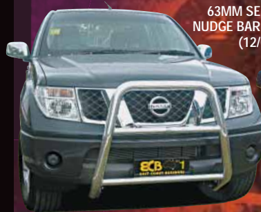
63MM SERIES 2 NUDGE BAR - D40 (12/05 On)

Each ECB Nudge Bar is designed to suit each individual model; therefore you can be assured of an aesthetically pleasing, functional and reliable design. The 76mm Nudge Bar comes complete with spotlight mounting provisions, together with a choice of polished or powder coated alloy finishes.