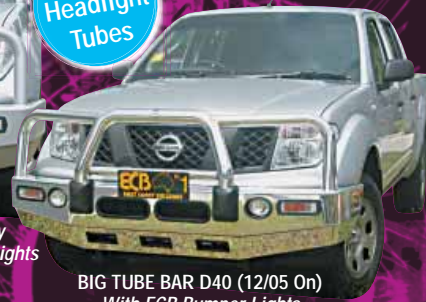
BIG TUBE BAR D40 (12/05 On) With ECB Bumper Lights