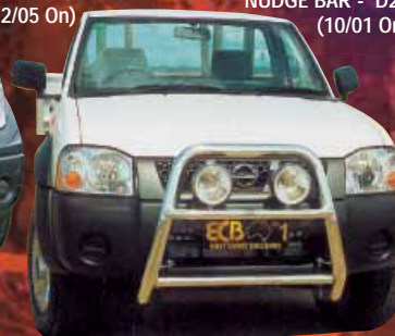
63MM SERIES 2 NUDGE BAR - D22 (10/01 On)

Great sports styling, bumper and grille protection are just a few of the features of the modern and functional 63mm Series 2 Nudge Bar. Formed from high tensile alloy tubing, with a lower centre tube for maximum radiator protection, these Nudge Bars have equal or better strength than poor quality, thinner sectioned, imported stainless steel products and are up to 50% lighter in weight. Spotlight mounting provisions together with a choice of finishes are standard inclusions.