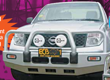
BIG TUBE BAR D40 (12/05 On) Silver Ripple Powder Coated Alloy Available with optional ECB Bumper Lights