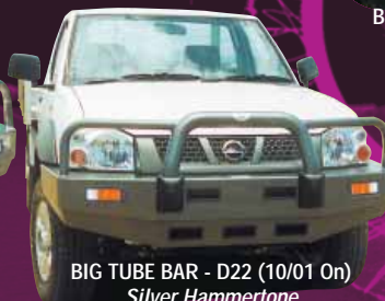
BIG TUBE BAR - D22 (10/01 On) Silver Hammertone Powder Coated Alloy Also available for 4/97-9/01 Models

When you're looking for the ultimate in vehicle protection, you can depend on the rugged, no compromise reliability of the ECB Big Tube Bar. This BTB is manufactured from high tensile, structural grade alloys and features fully gusseted headlight tubes.