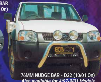
76MM NUDGE BAR - D22 (10/01 On) Also available for 4/97-9/01 Models

Impact protection is just one of the benefits of this eye-catching Nudge Bar. Designed and manufactured in Australia to suit our harsh Australian conditions, this 76mm x 4.7mm Nudge Bar is formed from high tensile alloy tubing and will never corrode or rust. It also has equal or better strength than poor quality, thinner section, imported stainless steel products and is up to 50% lighter in weight.