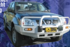
BIG TUBE BAR Navara D22 Silver Ripple Powdercoated Alloy