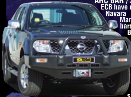
ARC WINCH BAR Navara D40 Black Ripple Powdercoated Alloy

ECB have now increased the range of frontal protection products for the Navara with the addition of two new Bumper-cut Arc Bars. Manufactured from high tensile, structural grade alloys, these bars offer maximum protection for the Navara via ECB's new Arc Bar Bumper-cut design. The ECB Arc Bar boasts a specifically designed steel mounting system to ensure a neat and sturdy fitment. The 6mm thick one-piece bumpers incorporate full width, braced 6mm thick lower protection skirts, while 63mm shoulder pipes provide superior protection for the headlights. Standard features include indicator/park light combinations, air-directional cooling vents, spotlight mounting provisions, integrated tow points and an aerial tab. For serious off-road enthusiasts,