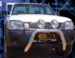
76mm NUDGE BAR Navara D22 Mirror Polished Alloy

Contact the ECB National Customer Service Centre for your local ECB Outlet