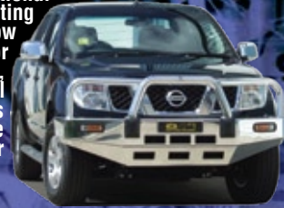
ARC BAR Navara D40 Mirror Polished Alloy

ECB now offer a low mount Arc Winch Bar that will accommodate up to a 9,500lb winch. Both Arc Bars also feature tapered designs that increase the approach angles of the Navara. Complete your bar with a mirror polished or powdercoat finish.