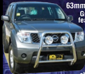
63mm SERIES 2 NUDGE BAR Navara D40 Mirror Polish Alloy

Great sports styling, bumper and grille protection are just a few of the features of this modern and functional 63mm Series 2 Nudge Bar for the Navara. Designed and manufactured in Australia to suit our harsh Australian conditions, this Series 2 Nudge Bar is formed from high tensile alloy tubing and will never corrode or rust. A lower centre tube provides added protection for the vehicle's delicate cooling equipment, and the bar is mounted solidly to the chassis via a specifically designed steel mounting system. This Navara Series 2 Nudge Bar comes complete with spotlight mounting tabs and is available in a choice of polished or powdercoated alloy finishes.