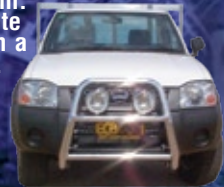
63mm SERIES 2 NUDGE BAR Navara D22 Mirror Polished Alloy