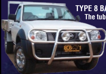
TYPE 8 BAR Navara D22 Mirror Polish Alloy

The tubular construction of the Type 8 Bar contours perfectly to suit the D22 Navara's aerodynamic styling. Manufactured from high tensile alloys, the Type 8 Bar will accommodate driving lights and provides optimum frontal protection for the bumper, grille and headlights.