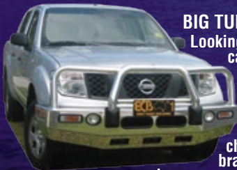
BIG TUBE BAR Navara D40 Mirror Polished Alloy

Looking for the ultimate in vehicle protection? You can depend on the rugged, no compromise reliability of this ECB Big Tube Bar. This sturdy Big Tube Bar wraps around in front of the existing front bumper, ensuring a neat fit and appealing design. The Big Tube Bar is manufactured from high tensile, structural grade alloys and features fully gusseted 63mm shoulder pipes. To ensure the best in vehicle protection the centre channel boasts a tapered 6mm thick one-piece design. A full width, braced lower protection skirt helps to further increase protection. Indicator/park light combinations, air directional cooling vents, driving light mounting points and an aerial bracket are all standard features.