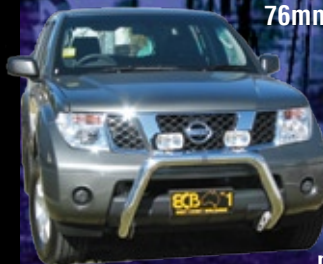
76mm NUDGE BAR Navara D40 Mirror Polish Alloy

Impact protection is just one of the benefits of this eye-catching 76mm Nudge Bar to suit the Navara. Designed and manufactured in Australia to protect your vehicle against the harsh Australian environment, this 76mm Nudge Bar is formed from high tensile alloy tubing and will never corrode or rust. This 76mm Nudge Bar comes complete with spotlight mounting tabs and a specifically designed steel mounting system. To complete a greatlooking performance product, choose from ECB's range of superior, low maintenance powdercoated finishes, or the ever-popular mirror polished alloy finish.