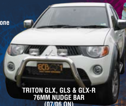
TRITON GLX, GLS & GLX-R 76MM NUDGE BAR (07/06 ON)

The tubular construction of the Type 8 Bar contours perfectly to suit the Triton's aerodynamic styling. Manufactured from high tensile alloys with a 63mm centre tube, the Type 8 Bar provides optimum frontal protection for the bumper, grille and headlights and fits sturdily with a steel mounting system. Driving light mounting provisions are standard inclusions and for a superior low maintenance finish where bugs wash off easily, why not choose from ECB's range of superior, low maintenance powder coated finishes? A durable cost saving alternative to polishing.