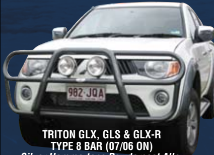
TRITON GLX, GLS & GLX-R TYPE 8 BAR (07/06 ON) Silver Hammertone Powdercoat Alloy

When you're looking for the ultimate in vehicle protection, you can depend on the rugged, no compromise reliability of the ECB Big Tube Bar. This new dimensional BTB wraps around in front of the existing front bumper bar, ensuring a neat fit and appealing design. This BTB is manufactured from high tensile, structural grade alloys and features fully gusseted 63mm headlight tubes. The tapered one-piece bumper incorporates a full width, braced Lower Protection Skirt while the specifically designed steel mounting system ensures a neat and sturdy fitment. ECB Bumper Light fitment (on GLS & GLX-R), Indicator/Park Light Combinations, Air Directional Cooling Vents, Driving Light mounting points and an Aerial Bracket are all standard features. To complete a great looking performance product, why not choose from ECB's range of superior, low maintenance powder coated finishes? A durable cost saving alternative to polishing.