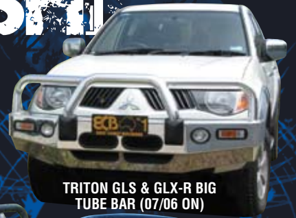
TRITON GLS & GLX-R BIG TUBE BAR (07/06 ON)