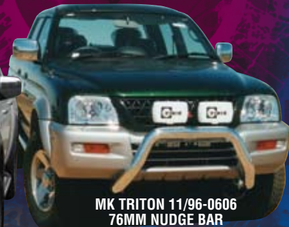
MK TRITON 11/96-0606 76MM NUDGE BAR

Impact protection is just one of the benefits of these eye-catching Nudge Bars. Designed and manufactured in Australia to suit our harsh Australian conditions, these 76mm x 4.7mm Nudge Bars are formed from high tensile alloy tubing and will never corrode or rust. They also have equal or better strength than poor quality, thinner sectioned, imported stainless steel products and are up to 50% lighter in weight. Each ECB Nudge Bar is designed to suit each individual model; therefore you can be assured of an aesthetically pleasing, functional and reliable design. The 76mm Nudge Bars come complete with spotlight mounting provisions, together with a choice of polished or powder coated alloy finishes.