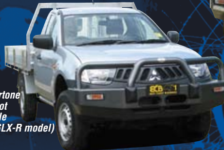
TRITON GLX BIG TUBE BAR (07/06 ON) Silver Hammertone Powdercoat (not interchangeable with the GLS/GLX-R model)