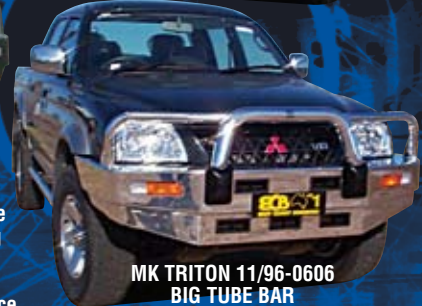
MK TRITON 11/96-0606 BIG TUBE BAR Mirror Polished Finish

When you're looking for the ultimate in vehicle protection, you can depend on the rugged, no compromise reliability of the ECB Big Tube Bar. This new dimensional BTB wraps around in front of the existing front bumper bar, ensuring a neat fit and appealing design. This BTB is manufactured from high tensile, structural grade alloys and features fully gusseted 63mm headlight tubes. The tapered one-piece bumper incorporates a full width, braced Lower Protection Skirt while the specifically designed steel mounting system ensures a neat and sturdy fitment. ECB Bumper Light fitment (on GLS & GLX-R), Indicator/Park Light Combinations, Air Directional Cooling Vents, Driving Light mounting points and an Aerial Bracket are all standard features. To complete a great looking performance product, why not choose from ECB's range of superior, low maintenance powder coated finishes? A durable cost saving alternative to polishing.