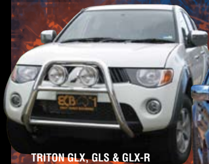
TRITON GLX, GLS & GLX-R 63MM SERIES 2 NUDGE BAR (07/06 ON)

Impact protection is just one of the benefits of these eye-catching Nudge Bars. Designed and manufactured in Australia to suit our harsh Australian conditions, these 76mm x 4.7mm Nudge Bars are formed from high tensile alloy tubing and will never corrode or rust. They also have equal or better strength than poor quality, thinner sectioned, imported stainless steel products and are up to 50% lighter in weight. Each ECB Nudge Bar is designed to suit each individual model; therefore you can be assured of an aesthetically pleasing, functional and reliable design. The 76mm Nudge Bars come complete with spotlight mounting provisions, together with a choice of polished or powder coated alloy finishes.