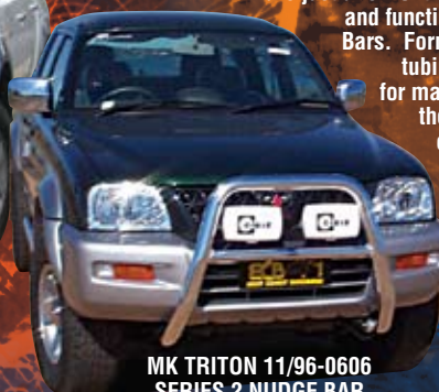
MK TRITON 11/96-0606 SERIES 2 NUDGE BAR

Great sports styling, bumper and grille protection are just a few of the features of these modern and functional 63mm Series 2 Nudge Bars. Formed from high tensile alloy tubing with a lower centre tube for maximum radiator protection, these Nudge Bars have equal or better strength than poor quality, thinner sectioned, imported stainless steel products and are up to 50% lighter in weight. Spotlight mounting provisions together with a choice of finishes are standard inclusions.