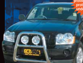
63MM SERIES 2 NUDGE BAR (07/05 ON)

Extra lower centre tube provides additional protection to the underside of the vehicle