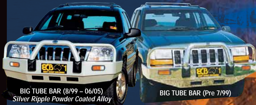
BIG TUBE BAR (8/99 - 06/05)