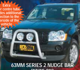
63MM SERIES 2 NUDGE BAR (07/05 ON)