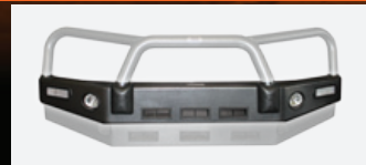
One Piece Channel