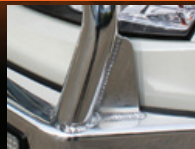
Fully Welded Gussets