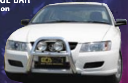
Executive, Acclaim SV8 & Standard Models

These modern and functional Series 2 Nudge Bars provide great sports styling and have the height advantage to offer bumper and grille protection. Formed from high tensile alloy tubing, the 63mm Series 2 Nudge Bars come complete with spotlight mounting provisions together with a choice of finishes.