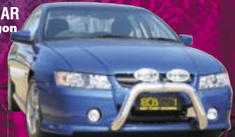
S, SV6 & SS Models

These 76mm Nudge Bars are not only an eye-catching addition to your vehicle; they are an ideal form of impact protection for those unexpected around town bumps. The sporty 76mm Nudge Bars come complete with spotlight mounting provisions and are available in a variety of finishes.