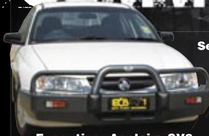
BIG TUBE BAR Sedan, Ute, Wagon & Crewman