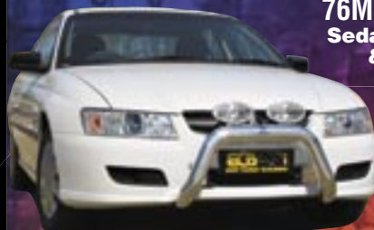
Executive, Acclaim SV8 & Standard Models