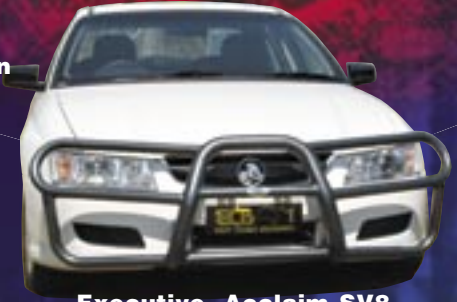
Executive, Acclaim SV8 and Standard Models - Silver Hammertone

The tubular construction of the Type 8 Bar contours perfectly to suit the VZ Commodores' aerodynamic styling. Manufactured from high tensile alloy with 63mm centre tubing, the Type 8 Bar provides optimum frontal protection in a tubular design of protection bar. The Type 8 Bar will accommodate driving lights and is available in a choice of finishes.