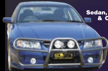
TYPE 8 Sedan, Ute, Wagon & Crewman

The country driver will find it hard to go past the unmatched strength, quality and style of the ECB Big Tube Bar. This aerodynamic "Bumper Wrap Around" design is manufactured from High Tensile Alloys, with 44mm Headlight Tubes enabling it to withstand almost any driving conditions. Extra large Cooling Vents, Indicator Park Light Combinations, Automotive Grade Trims and Spotlight Mounting Provisions are standard inclusions. To complete a great looking performance product, why not choose from ECB's range of superior, low maintenance powder coated finishes? Bugs wash straight off! A durable alternative to polishing.