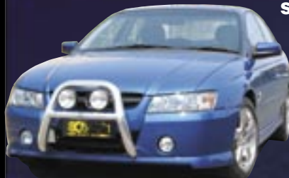
S, SV6 & SS Models