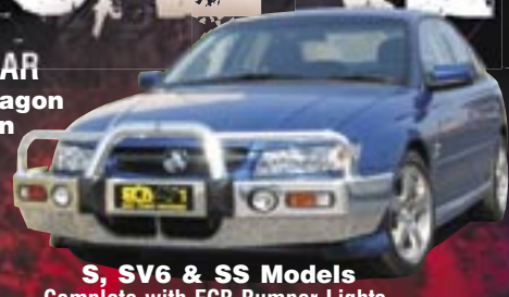
S, SV6 & SS Models Complete with ECB Bumper Lights.

The country driver will find it hard to go past the unmatched strength, quality and style of the ECB Big Tube Bar. This aerodynamic "Bumper Wrap Around" design is manufactured from High Tensile Alloys, with 44mm Headlight Tubes enabling it to withstand almost any driving conditions. Extra large Cooling Vents, Indicator Park Light Combinations, Automotive Grade Trims and Spotlight Mounting Provisions are standard inclusions. To complete a great looking performance product, why not choose from ECB's range of superior, low maintenance powder coated finishes? Bugs wash straight off! A durable alternative to polishing.