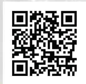
Scan Code Here To View Video