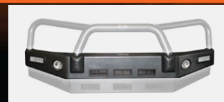
One Piece Channel