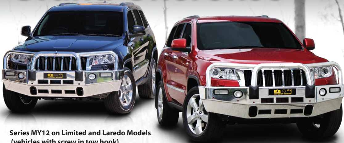
Series MY12 on Limited and Laredo Models (vehicles with screw in tow hook)