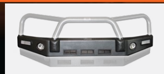
One Piece Channel