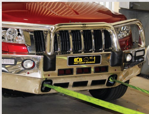
Tow Point Integration