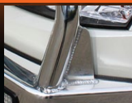
Fully Welded Gussets