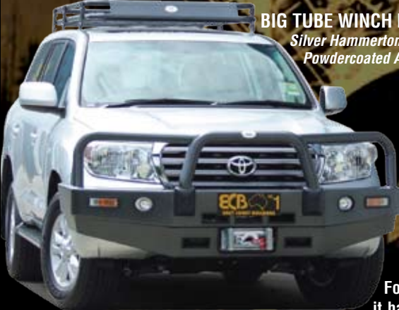
BIG TUBE WINCH BAR Silver Hammertone Powdercoated Alloy