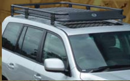
SERIES 2 - SIX LEG ROOF RACK Silver Hammertone Powdercoated Alloy

The ECB 200 Series LandCruiser Roof Rack is a perfect accessory for when your Cruiser just has no more cabin space to spare. This all alloy, strong, lightweight design is safe and very reliable, and is supplied with robust stainless steel mounting brackets and fitting hardware. Designed and manufactured here in Australia to suit the rugged Australian lifestyle, this Roof Rack is designed to handle loads up to the Landcruisers maximum roof carrying weight of 200kg's. As it weighs in at less than 35kg's, this Roof Rack offers an amazing 165kg's of load carrying capacity! Available in a range of powdercoated finishes and manufactured with a wind deflector as standard, this Roof Rack for the 200 Series is a must have accessory for anyone needing to carry extra equipment.