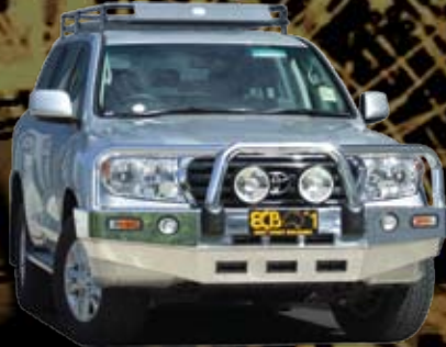
BIG TUBE BAR (with optional ECB bumper lights) Mirror Polished Alloy

For the ultimate in frontal protection, you will find it hard to go past the strength, quality and style of the ECB Big Tube Bar and Big Tube Winch Bar for the latest 200 Series LandCruiser. Manufactured from high tensile, structural grade alloys, these bumper-over bars combine traditional engineering methods with revolutionary modern design to give you a true 'no compromise' solution to protecting your tough Cruiser. These tapered 6mm thick one-piece bumpers incorporate full width, braced 6mm thick lower protection skirts while specifically designed steel mounting systems ensures a neat and sturdy fitment.