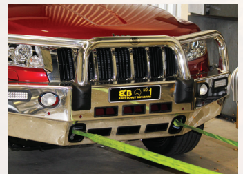
Tow Point Integration